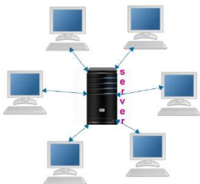
LAN Connection Available

Software helps manage Student, Teacher, Courses, Batches, Fees, Attendance, and Marks. Software provides easy reports like outstanding fees, Marks, Attendance etc. This is a must have software for all coaching institutes. For quite some time we have been asked by several institutes to develop software that is focused on coaching institute requirements. CIMS is developed after collecting requirements from several institutes in different fields. The product is very easy to use and it is developed with the consideration that the operators who are not familiar with using computers should also be able to use it easily.