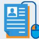
Student Registration Management